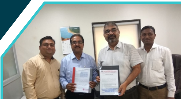
While signing the MOU